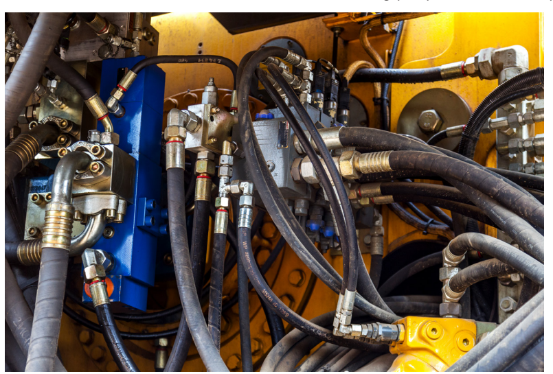
In contrast to electric actuators, hydraulic systems are complicated due to the requirement of hoses, connectors, valves, filters and switches to operate.

Supporting this complex process requires an external system of hoses, connectors, filters, switches, valves and pumps that cycle the fluid to and from the cylinder, enabling movement. This is repeated for every axis of motion. Even the smallest system requires space-consuming, moving components, which introduces a higher than average risk of system failure.