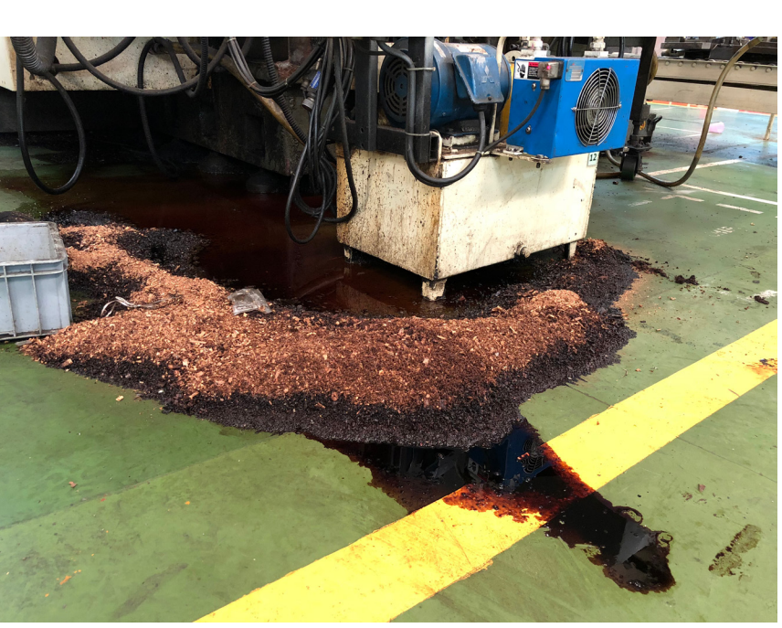
Hydraulic systems use various types of fluid that can be messy, slippery and hazardous to humans and the environment. As hydraulic fluids lose effectiveness over time, special care and regular maintenance is critical.

fluid exposure limits. For example, the U.S. Occupational Safety and Health Administration (OSHA) has set an exposure limit of 2,000 milligrams per cubic meter (mg/m<sup>3</sup>) of petroleum distillates for an 8-hour workday and 40-hour workweek.<sup>3</sup> The National Institute for Occupational Safety and Health (NIOSH) recommends an even stricter exposure limit of 350 mg/m<sup>3</sup> of petroleum distillates for a 10-hour workday and 40-hour workweek.